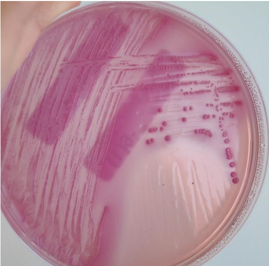
Figure 1: Typical appearance of E. coli on MacConkey agar supplemented with 1 mg/L cefotaxime.

10 \mu L plated to confluent growth (sample A).