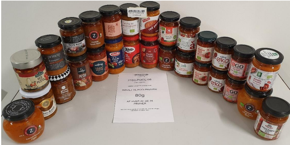
Figure 3. Composite sample of Tomato Pesto (2103-POOL-08), with each of the 25 brands contributing 80 g.

All sampling details, including date, store, and product information such as ingredients, were recorded (see Appendix A). Packaging details, including nutritional or health claims and net weight, were also registered and will be available in the next version of the Danish Food Composition Database, to be published at www.frida.fooddata.dk . More detailed information on the 17 composite samples is provided in Appendix A.