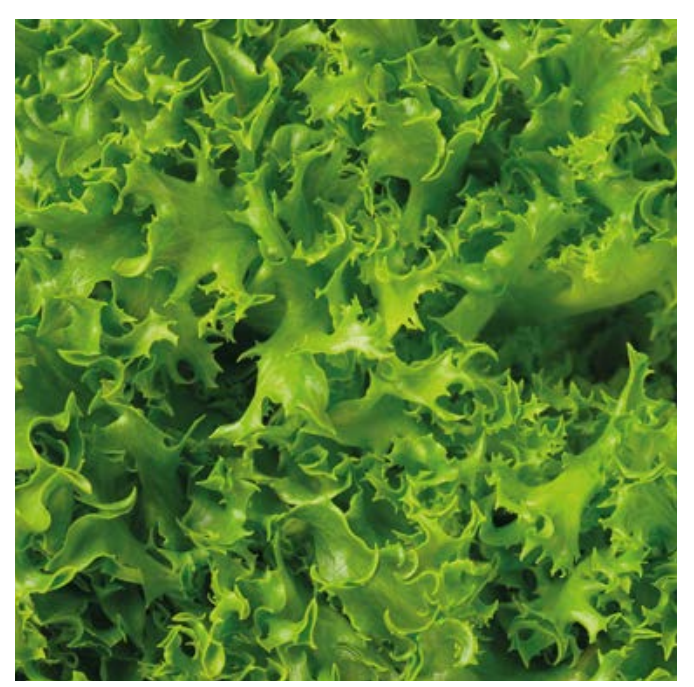
The National Food Institute develops detection methods that can be used to determine the cause of foodborne disease outbreaks both in Denmark and abroad. Lollo Bionda salad.