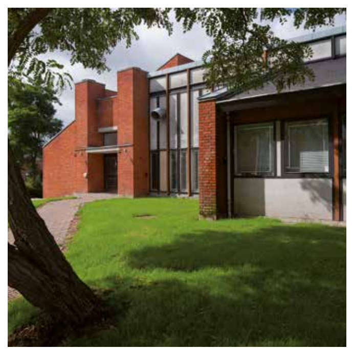
For more than 50 years, Mørkhøj Bygade in Søborg was home to the majority of the National Food Institute's activities.

Building C in Mørkhøj. National Food Institute