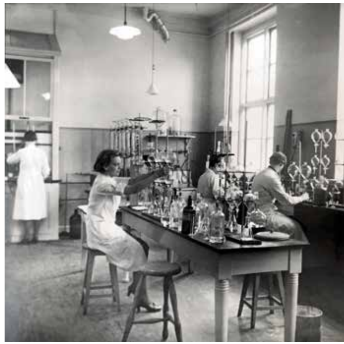
The National Vitamin Laboratory, whose history goes back to 1931, was in 1969 merged with the National Food Institute of the time, which is one of the precursors of the present National Food Institute.

Chemical laboratory at the National Vitamin Laboratory cirka 1940. National Food Institute