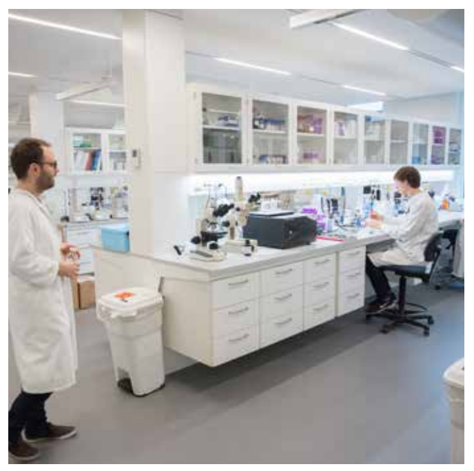
The National Food Institute has at its disposal approximately 6,700 m² chemical laboratories, food technological laboratories, microbiological laboratories, laboratories for effect studies, and animal testing facilities.

Chemical laboratory at the National Vitamin Laboratory cirka 1940. National Food Institute