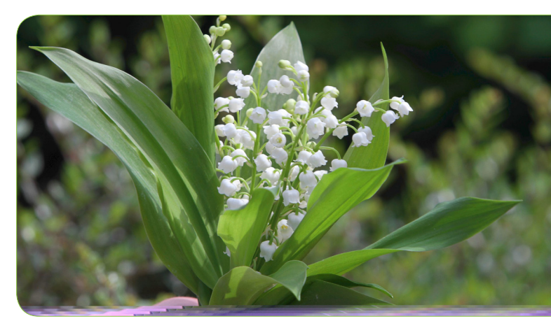
Figure 3: Flowering lily of the valley.

Colombo et al. (2009) report 29 cases over a 12-year period where lily of the valley has been the cause of poisoning – without fatalities. The possibility of mistaking ramson with lily of the valley is also mentioned, but there are no details on how many of the cases are caused by such a mix-up. Cooper & Johnson (1998) report one case of poisoning where ramson was mistaken for lily of the valley and made into a soup. The people involved became hot, flushed, and tense and experienced additionally symptoms like headaches, hallucinations and red skin patches.