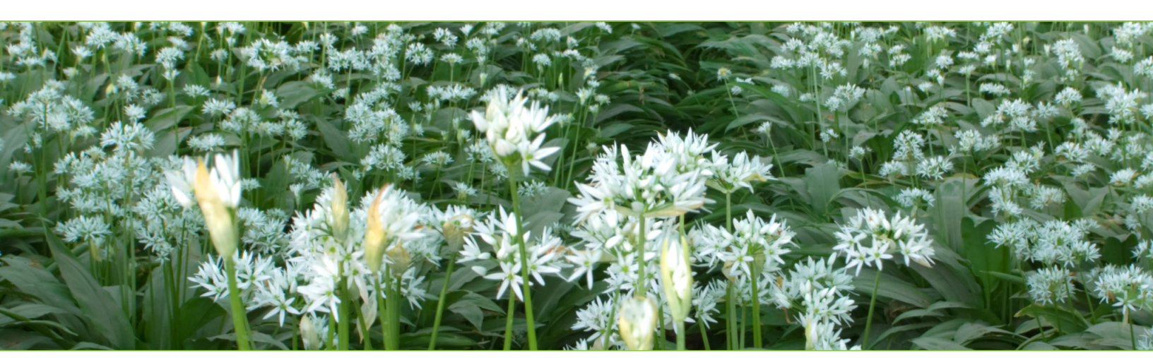
Figure 2: Flowering ramson.

The toxin in autumn crocus is colchicine. The leaves from autumn crocus contain between 0.075-0.2% colchicine. A portion of salad containing 60 g of leaves contains 45-120 mg colchicine. Symptoms of intoxication occur after ingesting 0.5 mg per kg of body weight, while doses in excess of 0.8 mg per body weight are lethal. This means that if a person weighing 60 kg consumes a portion of salad weighing 60 g, there is a risk that the person is ingesting a lethal dose.