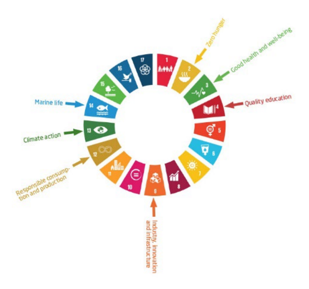
Figure 2. The SDGs to which the Institute contributes