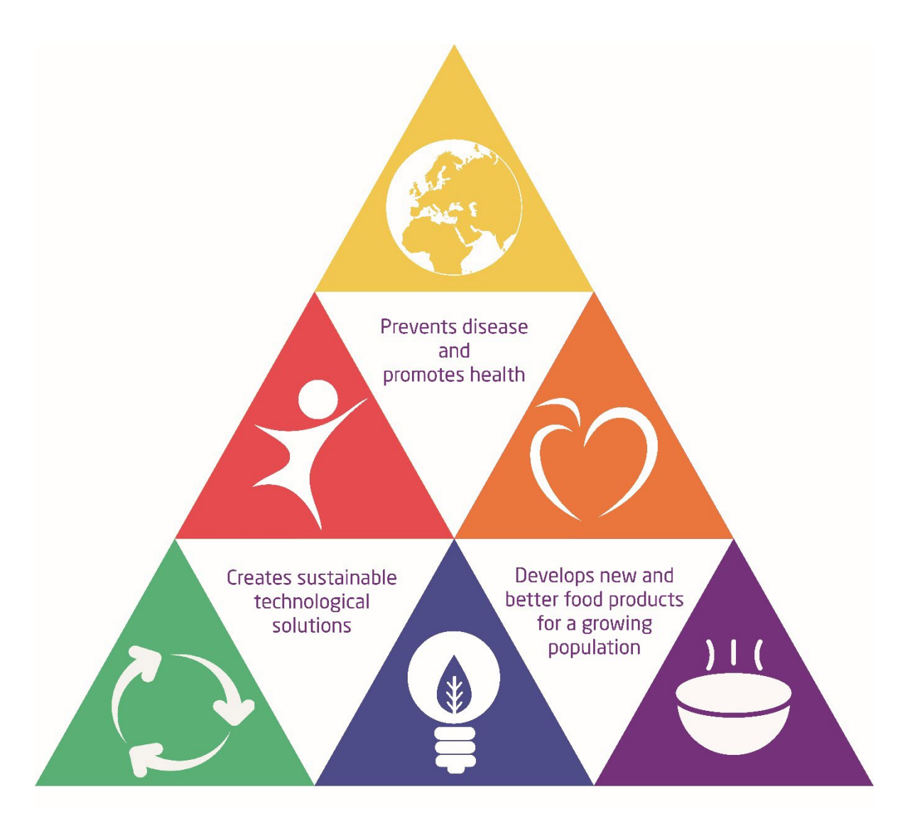
Figure 1. The DTU National Food Institute's vision